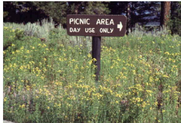
Picnic areas and campgrounds overrun by St. Johnswort.

Wildfires and weeds share much in common, including impacts, spread, and management.