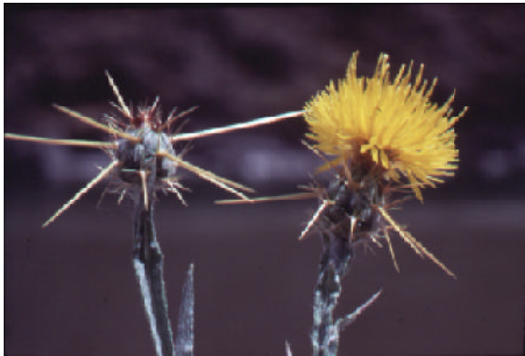
Wildlife habitat, wilderness, and recreation areas invaded by yellow starthistle.

Invasive noxious weeds have been described as a raging biological wildfire—out of control, and spreading rapidly. The devastation from these alien plants includes enormous economic losses to agriculture and irreparable ecological damage to wildlands. Millions of acres have been invaded or are at risk including rangelands, forests, wilderness areas, national parks, recreation sites, and wildlife management areas.