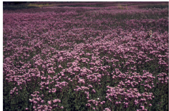
Permanent change in wildland plant and animal community caused by noxious weeds.

When considering long-term ecological effects on the land, invasion by aggressive non-indigenous noxious weeds is far more damaging than any wildfire.