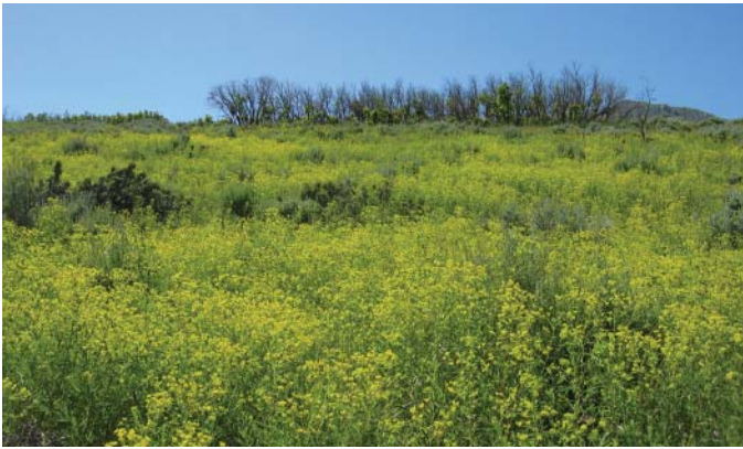
Leafy spurge can become quickly established in undisturbed areas.

Reproduction of leafy spurge will occur vigorously from both roots and numerous seed heads. Roots have been found to grow more than 10 feet vertically and horizontally, any part of which can regenerate a new plant. Seeds are enclosed in capsules which ultimately burst and disperse up to 15 feet in all directions. Most seeds will germinate within a year; however, they may last in the soil for up to 8 years. Seeds also float easily and therefore spread rapidly by water. Leafy spurge will colonize and reproduce on nearly all sites but prefers dry sites with a coarse soil; even heavily shaded woodlands are prone to infestation. Invasion into undisturbed areas is not uncommon, making it difficult to protect the land from new invasions.