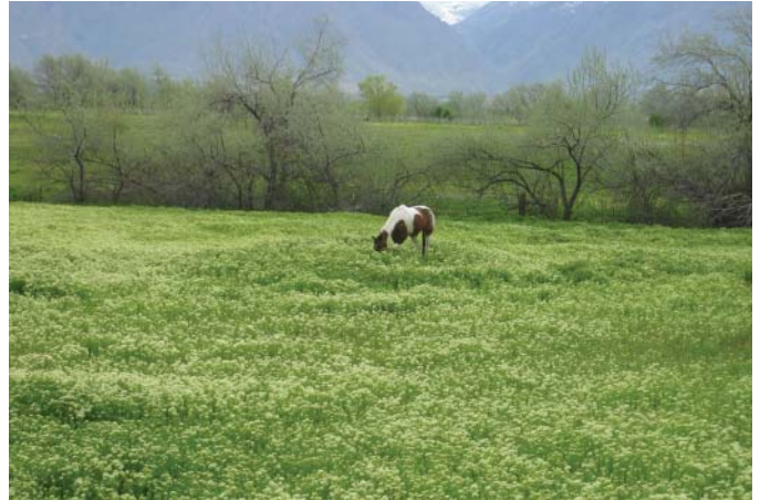
Large infestation of hoary cress

most successfully through sprouting from extensive root systems. It is most commonly spread through waterways and along roads from human activity. Like most noxious weeds, hoary cress is unpalatable to most animals, especially after flowers have bloomed. Hoary cress is shade intolerant and prefers moist soils in irrigated meadows, roadsides and other disturbed sites.