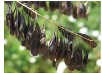
dyer's woad seeds

sites are usually the first sites to become occupied, but rangelands and wooded areas are quickly invaded. Dyer's woad also releases chemicals that inhibit the germination of other plants, giving it an extra advantage over native plants. Dry, rocky areas are most favored by this plant, often making it a difficult weed to control.