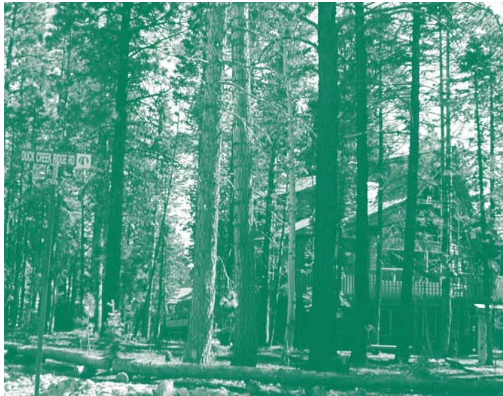
Utah homeowners in the wildland-urban interface may need to cut a few trees and keep pine needles cleaned up.

State Farm insures nearly one of every four homes in Utah, making this a significant move in the state, although only a small percentage of Utah at-risk homes will be inspected this year.