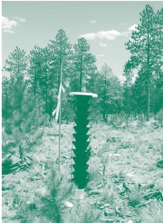
Traditional funnel traps use synthetic pheromones to attract beetles.

further studied. The boxed log, being protected from attack, is then able to emit these chemicals that attract beetles. It does not sound like rocket science at the outset, but get into it much further and you might think that it was.