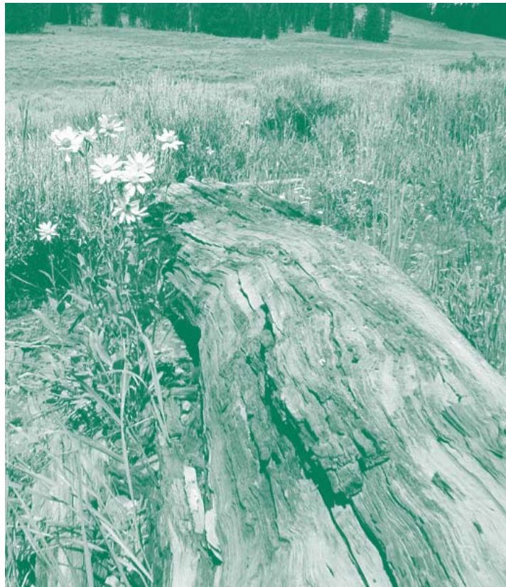
Large woody debris like this log play an integral role in the formation of healthy forest soils.