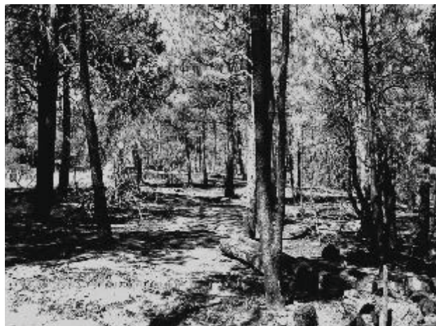
This photo was taken from the edge of the Los Alamos community, looking into the forest after the fire. Notice that the fire burned the material on the ground, including the woodpile in the foreground, but the needles on the trees remained unburned.

fire event like Los Alamos, agency equipment is soon overwhelmed, as the advancing front of a fire can be hundreds of yards wide and ignite several homes simultaneously.