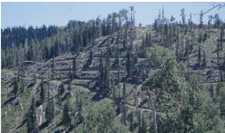
The horizontal scars on this hillside are unnecessary; too many skid trails, too close together.