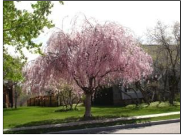
Double Pink Weeping Cherry