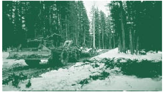
Contract stipulations, such as the time of year that harvesting is allowed, can help protect the future productivity of your forest.

7. Develop a Written Timber Sale Contract – This legal document specifies the responsibilities of the seller (you) and the buyer (timber contractor and any sub-contractors, such as the logger), and protects the interests of all by preventing misunderstandings and miscommunication. You may want to reference your timber harvest plan and/or Utah's Forest Water Quality Guidelines in your timber sale