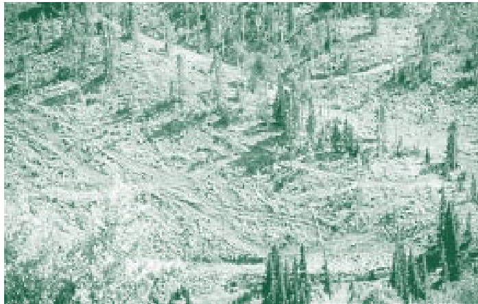
Careful harvest planning, including a detailed timber sale contract, can mean the difference between the harvested area pictured above and the one below. Above, excessive soil exposure leads to erosion, negatively impacting future site productivity, degrading water quality, and creating an eye-sore. Below, strategically placed roads and skid trails minimize soil exposure and negative impacts to productivity, water quality, and aesthetics.

– Stay on-site for the first few days to answer any questions and ensure that the operation works as planned. Then visit the site weekly (accompanied by your professional forester, when possible), to check on the operation and bring up problems as they arise, while they can be corrected. If you cannot be present, have your forester administer the harvest.